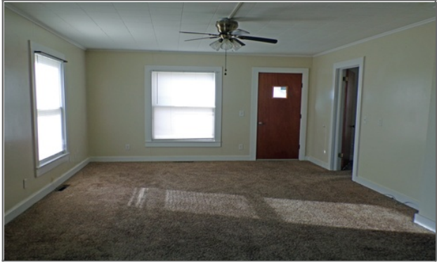
Living Room/Dining room