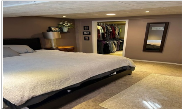
Basement Master Bedroom