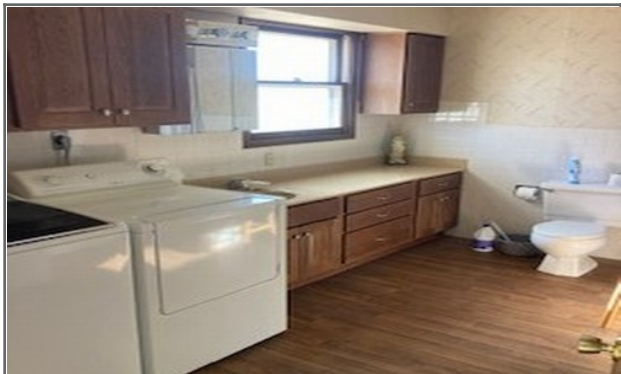
Bathroom with Laundry